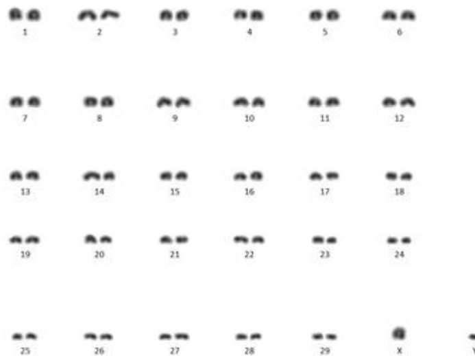
Fig 1: Mitotic-metaphase spread of Nandidurga buck

The acrocentric nature of X-chromosome in the present study was in agreement with the reports for Korean native goats (Yeo, 1984), Berari (Kasabe et al. , 2009), Mahabubnagar (Umadevi et al. , 2011), Karnataka local goats (Jayashree, 2014), Sangamneri (Bhagat et al. , 2014), Osmanabadi and Boer bucks (Kokani et al. , 2018) and Native Black Bengal goats (Banani et al. , 2018). In contradiction to the present