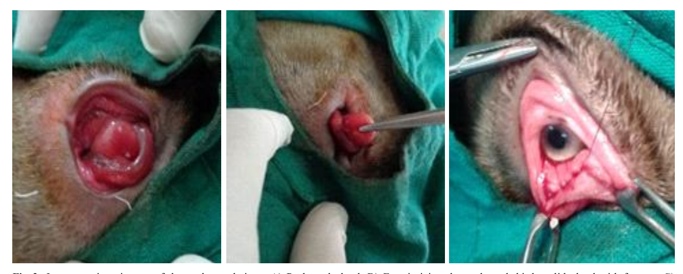
Fig 2: Intraoperative pictures of the pocket technique: A) Prolapsed gland. B) Exteriorizing the prolapsed third eyelid gland with forceps. C) Repositioning of the gland and application of a single layer simple continuous suture

The protrusion of third eyelid generally happens because of inflammation and resulting irritation that deteriorate the cosmetic appearance of animal. The affected gland should be replaced because removal of it lowers tear values by 15-26% in cats and up to 40% in dogs. The Morgan's pocket technique of surgical repositioning is simple to perform and is having very high success rate (Dugan et al., 1992). The only side effect, that is the reduced mobility of the third eyelid have been encountered with the pocket technique in few cases (Plummer et al., 2008). Recurrence of the prolapsed gland observed in three eyes in the present study was probably because of suture breaks. Superficial corneal ulcers were also recorded in these 3 unsuccessful cases with history of prolapse for longer durations (>2 months). The use of