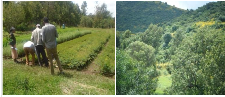
Fig 6: and 7: Agro forestry under SLM program.