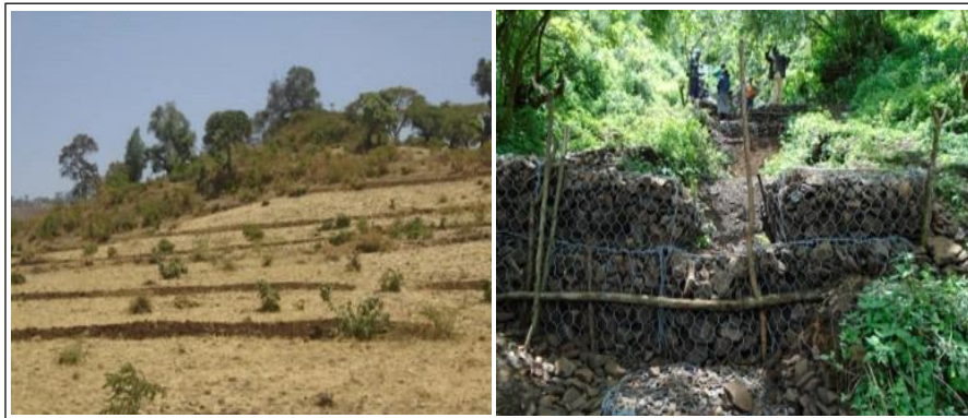
Fig 8: and 9: Soil and water conservation practices under SLM program.