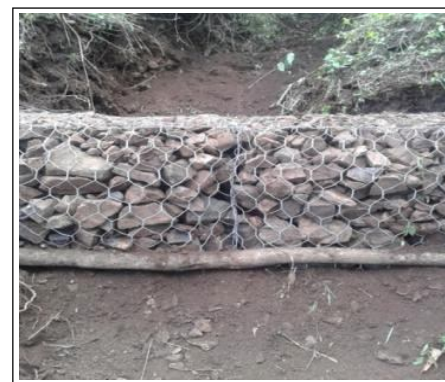
Fig 3: Stone bunding.