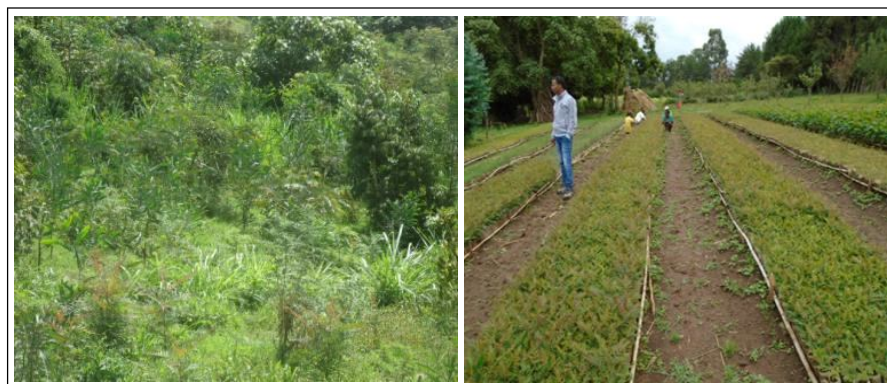
Fig 4: and 5: Agroforestry practiced in farmlands.