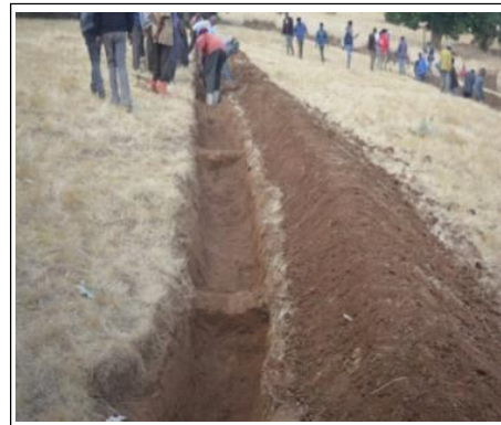
Fig 2: Deep trenching.

Inputs such as fertilizers and pesticides are expensive. Lack of money was the biggest challenge as the prices are beyond the reach of smallholder farmers. Seeds and implements such as ripper and direct seeder were not available. This result confirms the finding of Agbahey et al. , (2015). Many practiced the traditional way of mixing ash with water and sprinkling on the plants. Crop residues are burnt for this purpose, rather than using it as mulch.