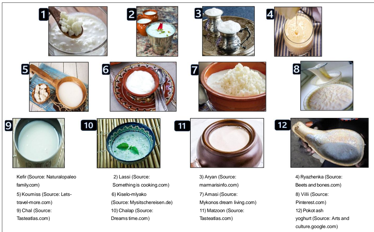
Fig 1: Pictures of different fermented beverages.

Slow heating of milk helps to produce prebiotic lactulose. Lactulose helps bacteria to grow in GI tract, inhibition of pathogens, blood insulin and glucose level maintenance, etc. In Russian primary schools, ryazhenka has been included in the diet after the COVID-19 pandemic (Wang et al. , 2022; Miroshnikova, 2022). It has remarkably