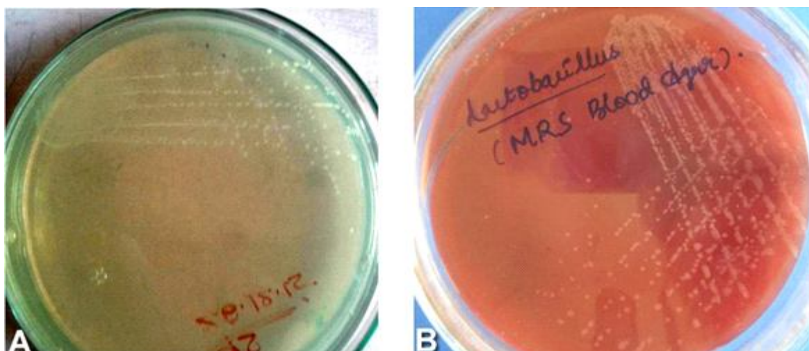
Fig. 1: A) MRS agar plate showing pure white transparent colonies of Lactobacillus species B) MRS blood agar plate showing non-haemolytic colonies of Lactobacillus species